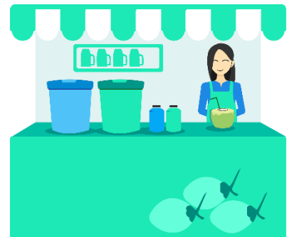
24. shop assistant