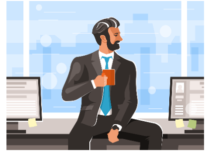
27. bank manager