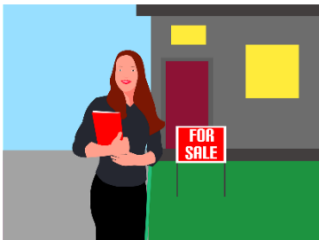
19. estate agent