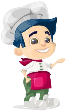
31. chef = cook