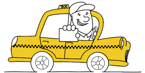
30. taxi driver