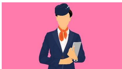
10. flight attendant