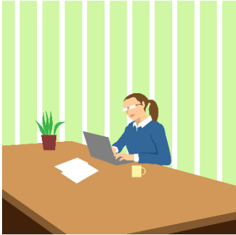
16. office worker