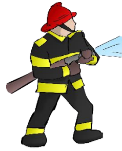
15. fireman = firefighter