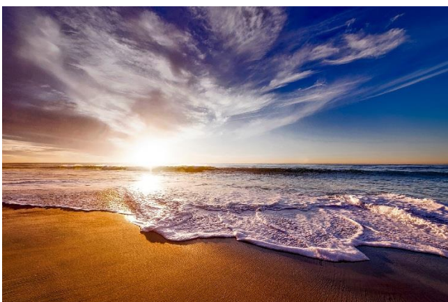
ON THE SEA FRONT