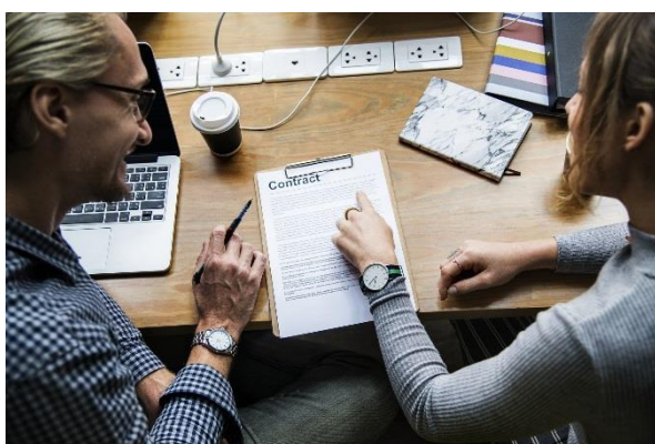
ENTREPRENEUR / PIONEER